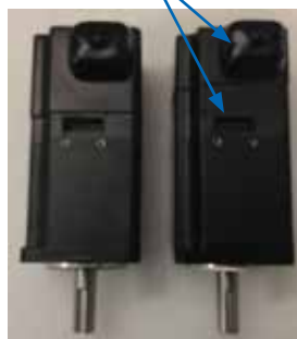
Rev A Rev M