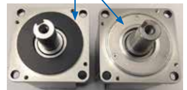
Rev A Rev M

Power and feedback connectors in slightly different location with feedback connector angled