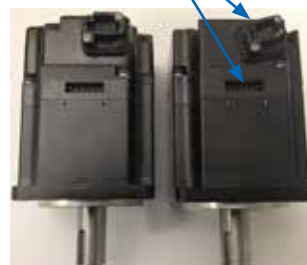
Rev A Rev M

Power and feedback connectors in slightly different location with feedback connector angled