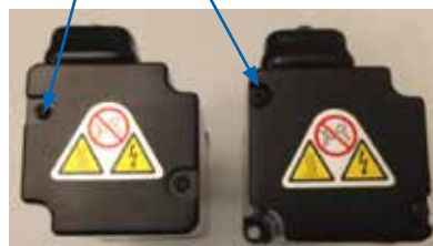
Rev A Rev M